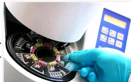
Functional reagent package with microfluidically imprinted protocol