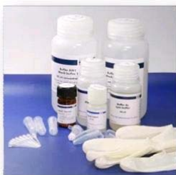
Reagent kit & protocol