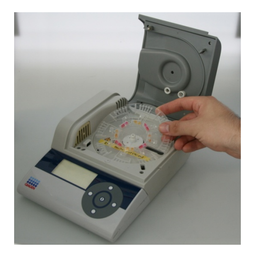
Fig. 1. The portable LabDisk Player. Integrated magnets can be used for the automated control and manipulation of magnetic beads e.g. for nucleic acid purification or bead based immunoassays

The LabDisk Player is able to run a fully automated and defined rotation- and temperature protocol to control the complete analysis. The processing device incorporates a heater for isothermal incubation or nucleic acid amplification at up to 60 °C and two detection units for either fluorescence or chemiluminescence readout (Figure 1).