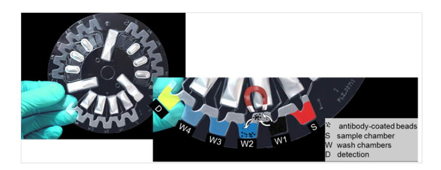
Fig. 3. Disposable LabDisk for immunoassay: reagents are stored in aluminium pouches

The immunoassay is based on a sandwich ELISA where one anti-ricin antibody is covalently linked to magnetic beads as solid phase. It will allow the detection of ricin from blood plasma samples. Figure 3 shows a LabDisk with the microfluidic design for the immunoassay with integrated aluminum pouches for reagent pre-storage. Primary tests show the successful detection of 10 ng/ml ricin from a citrated blood plasma sample in 45 minutes of which 30 minutes are needed for incubation. For the primary tests reagents were stored in cavities on the cartridge without the aluminum pouches. In the current stage, the readout is performed by absorption measurements. For that, the LabDisk is taken out of the processing device and readout in an external photometer. Completely automated testing and chemiluminescence detection in the LabDisk player is currently under validation.